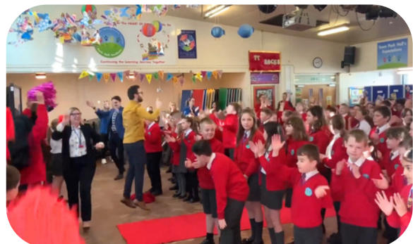
Weekly celebration assemblies - red carpet, dancing, music and achievements!